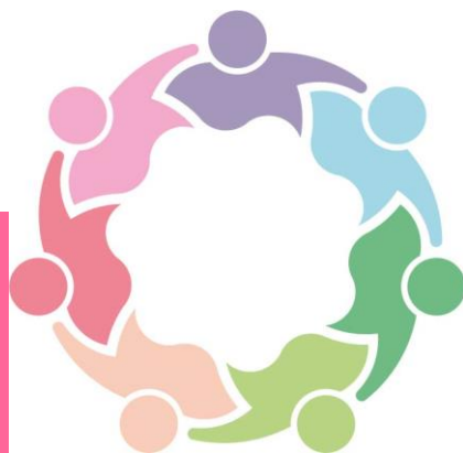
Stay Well, Stay Connected