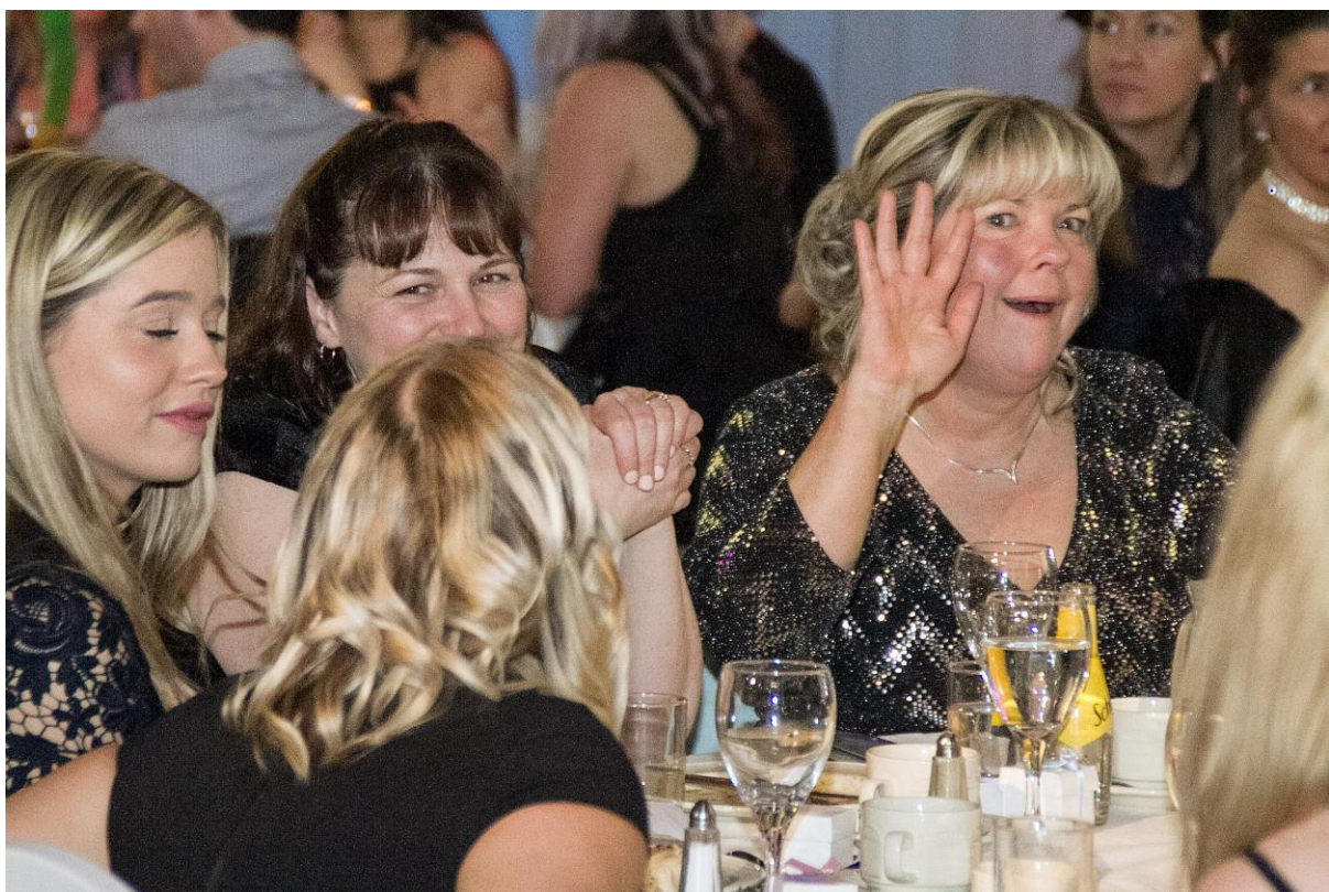
Good evening everyone . . . staff enjoy themselves at the HEART Awards