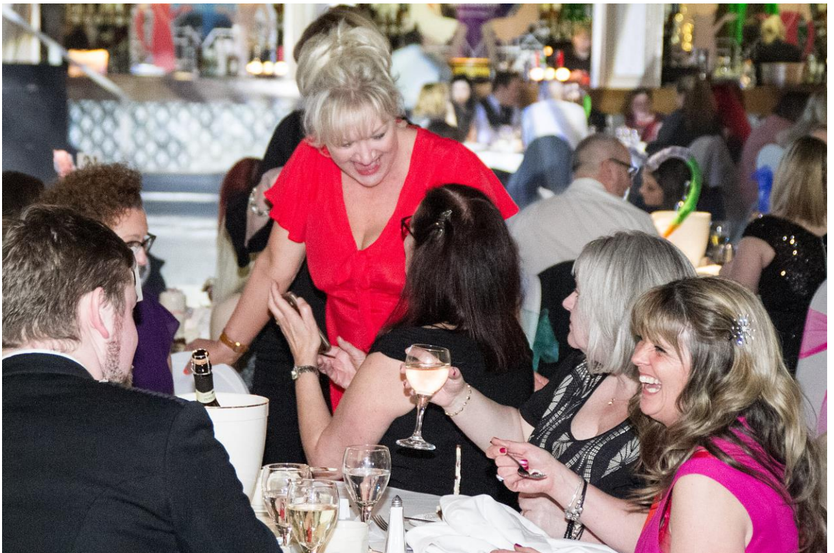
All smiles . . . colleagues share a joke (and soft drinks)