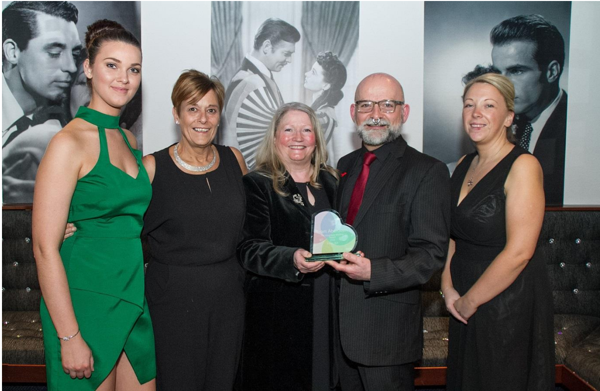
The Exchange Clinic Team, #TeamAberdeen finalists