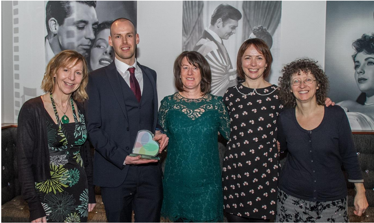
The Carers Exercise and Information Group, finalists in the Empowering People category