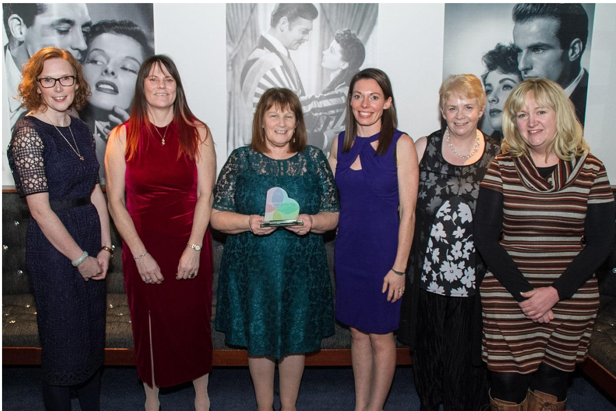
The Fit2Care Programme Planning Group, who were finalists in the Communication & Inclusion category