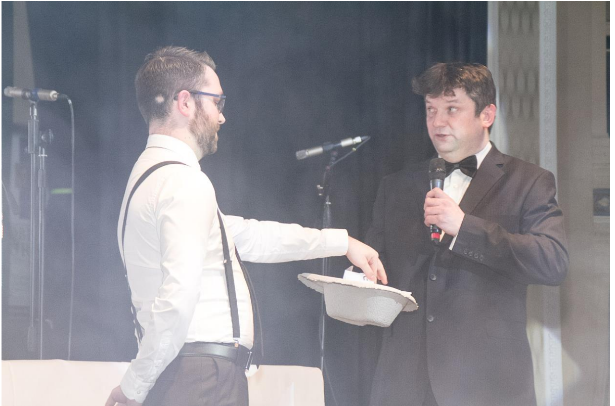
Following doctor's orders . . . our party game winner selects the winning charity . . . from a bedpan