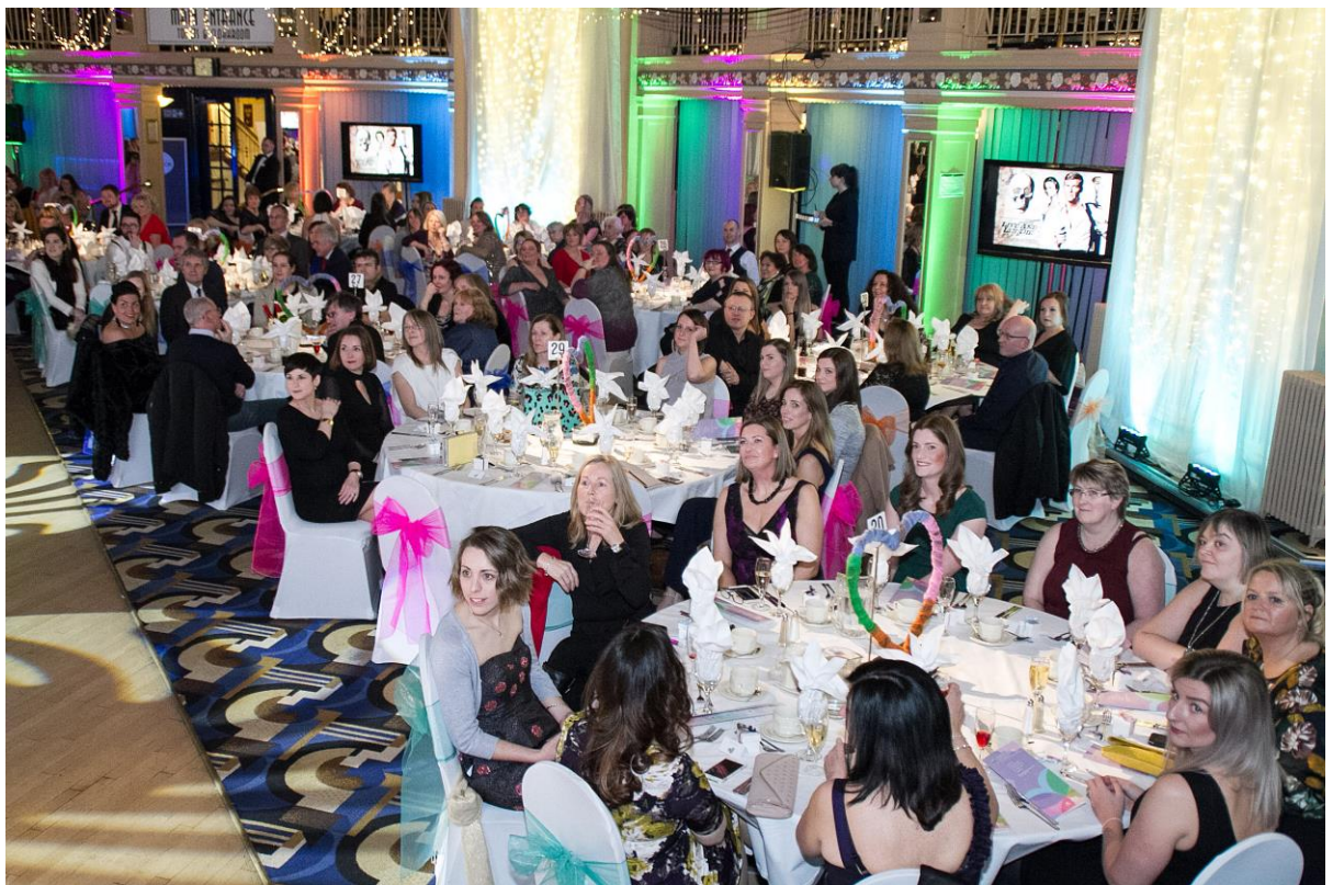
Just a few of the 350 guests at the evening