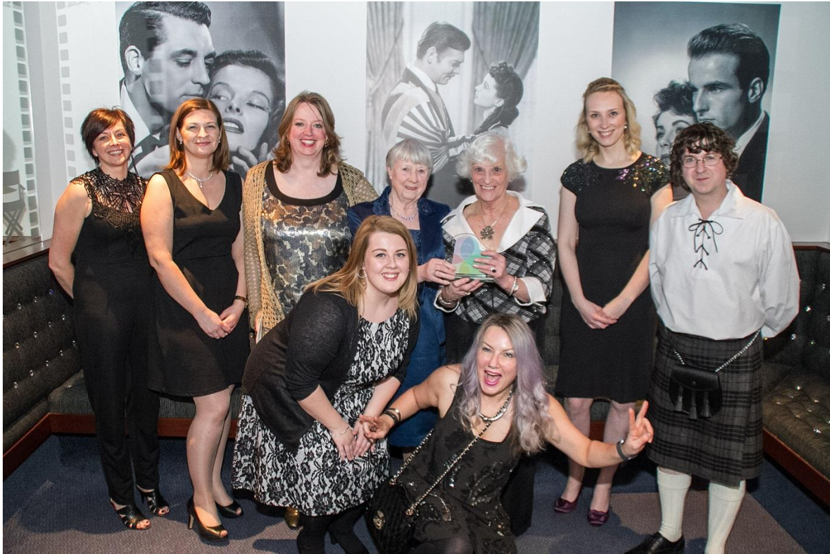
The West Locality Community Partners Group, who were Communication & Inclusion Award finalists