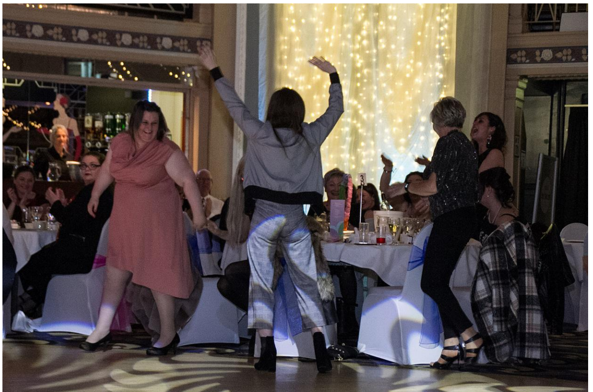
We won the cup . . . ! Staff react with typically calm professionalism after hearing they've lifted a trophy . . .