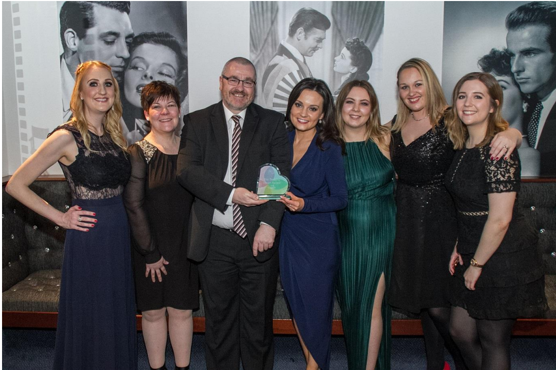
The Hospital-Based Social Work and Discharge Hub, finalists in Beating Heart award