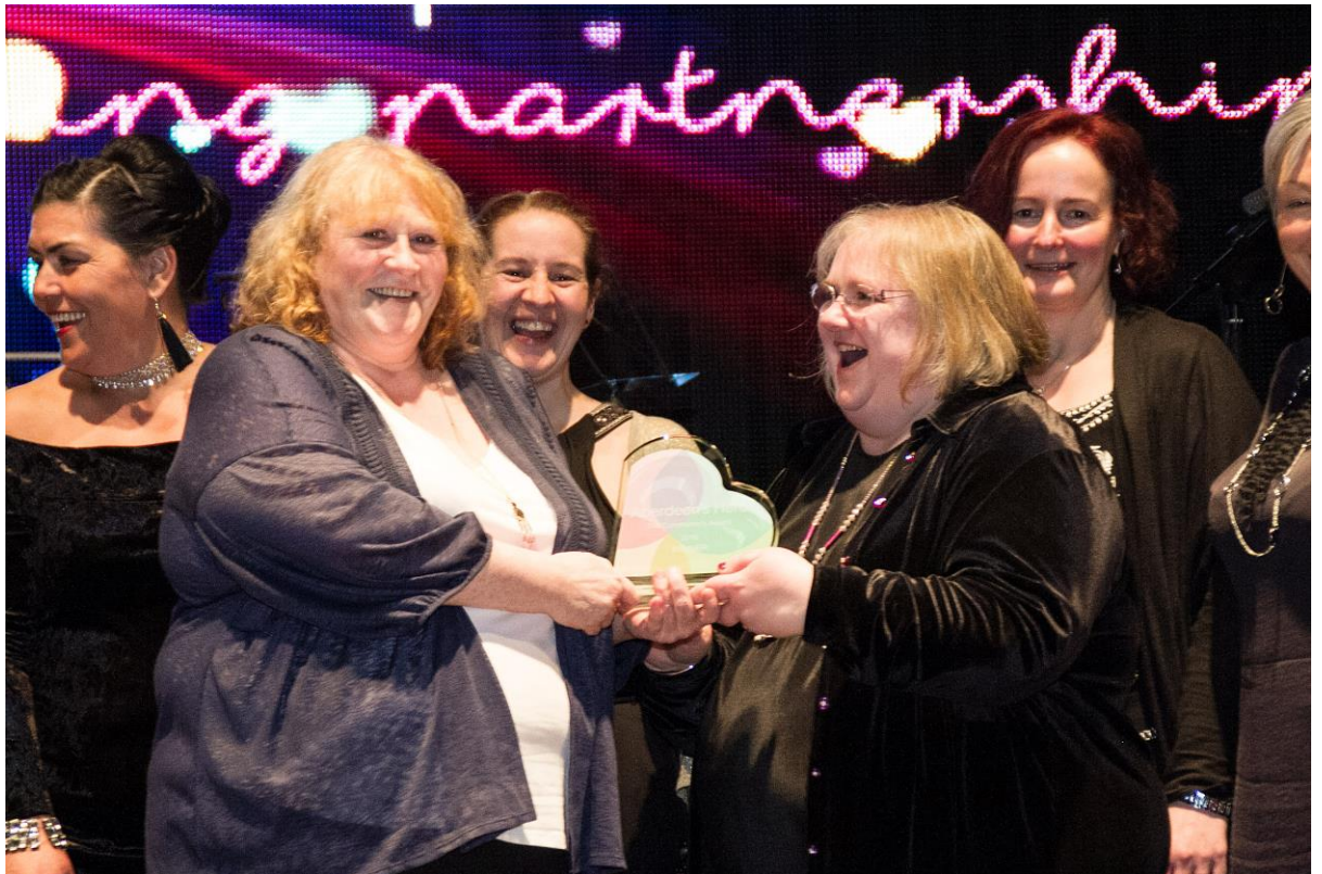
All heart . . . category winners are delighted with their award