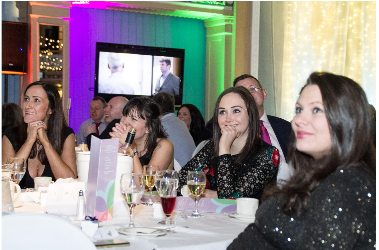
Staff enjoy the astonishing acting skills of the cast of our James Bond-themed movie