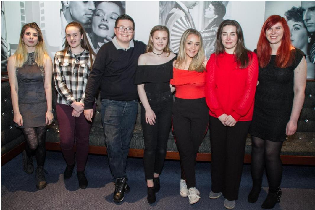
Art and design . . . Kincorth Academy students designed wonderful posters for the Falls Clinic recently